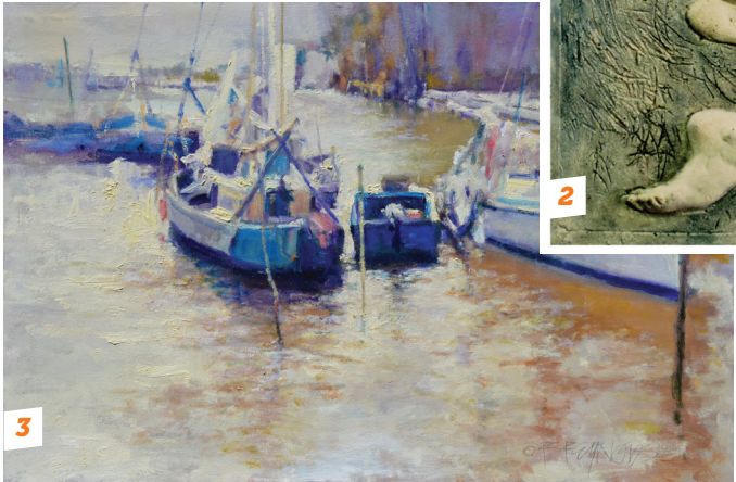
3 Morning Boats Roy Reynolds