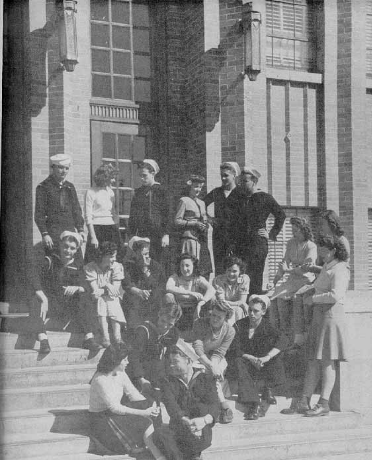
... A SCHOOL OF NAVY AND CIVILIAN STUDENTS