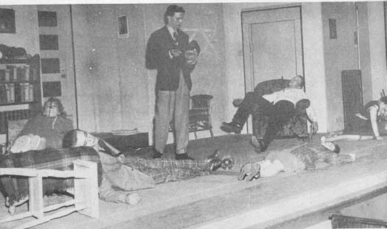
Plague? No, the young actors rehearse their play. The knives are fastened on with metal bands. Relax!